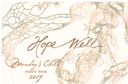
Monday's Child Hope Well 2019 Pinot Noir Eola-Amity Hills 200 six-bottle cases produced