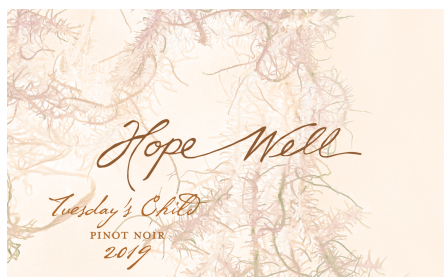
Tuesday's Child Hope Well 2019 Pinot Noir Eola-Amity Hills 200 six-bottle cases produced